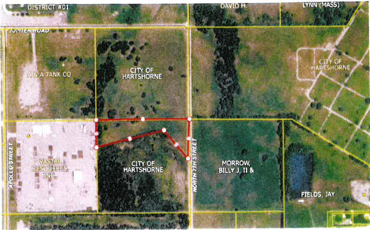
Parcel 1 Approximately 3.03 acres – North end area for baling – Lot 18, Townsite Addition #16